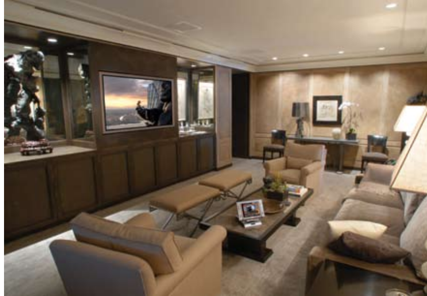
Maximum Home Theater: The Duchossois family enjoys having hundreds of movies and music titles available at their fingertips in their relaxing home theater.

"Coming in, one button. Going out, one button. Security, one button. Sound system...you've got lots of buttons, but it's easy to pick one right from the chute. Really, it's an ease of living issue."