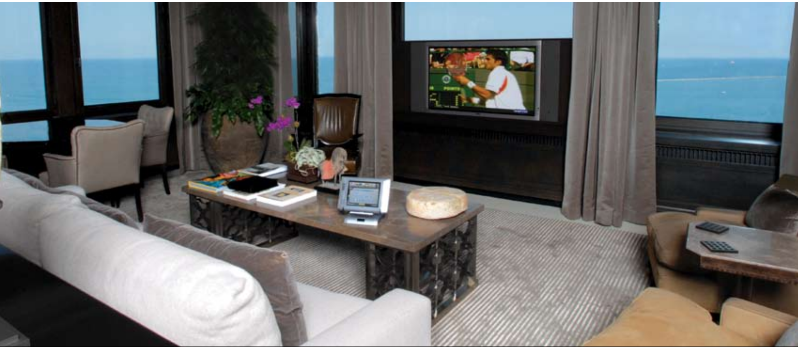
A Room With A View: The AMX Touch Panel instantly draws the shades, dims the lighting and plays a movie - all with one touch.

"We sat down with representatives from AMX, and they said 'we're going to make it simple for you. We will interface with everything that you need in your home to whatever extent you want.'